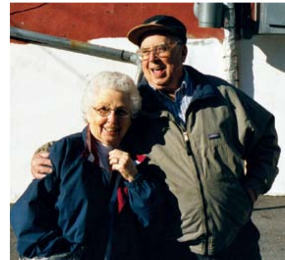
FIGURE 1. The Ohio Benefit Bank Tax Assistance, Work Support, and Assistance Programs

since its inception The Ohio Benefit Bank has helped 2,668 families access up to $7.3 million in federal food assistance resources. As families used these resources, an estimated $3.6 million in income and more than $470,000 in state and local taxes were generated. In total, The Ohio Benefit Bank's efforts to help families access food assistance resources alone is estimated to have injected up to $11.4 million into Ohio's economy.